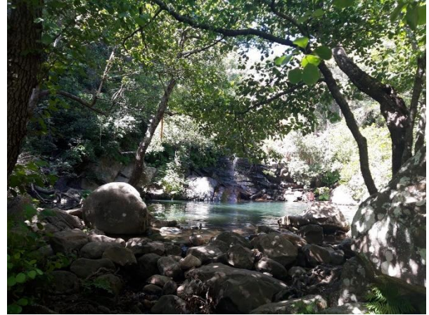
View of the spring in 'La Garganta del Capitan'.

opportunities for hiking and outdoor activities. One of my favorite hikes is 'La Garganta del Capitan', a path that leads through a valley, culminating in a refreshing spring and a small waterfall, making it a popular spot among locals and tourists alike.