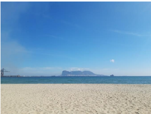
View of Gibraltar from Palmones (Los Barrios beach). Picture taken by the author.