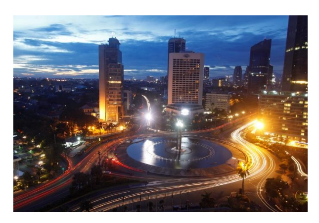
"City and traffic lights at sunset in Jakarta" by World Bank Photo Collection is licensed under CC BY-NC-ND 2.0.