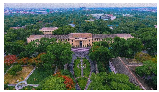
"Mandalay University Library"

Mandalay University, located in the second largest city and the old capital of the last Myanmar Kingdom, offers undergraduate and postgraduate programs in Upper Myanmar. The university has started running a new research comprehensive facility at the main library. In association with other universities across the country, Mandalay University Library and Research center conducted a series of seminars: How to maximize the impact and efficiency of research as part of eLibrary Myanmar projects. When I was a graduate student of Mandalay University, I had a great opportunity to attend such seminars, result-