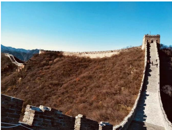
The Great Wall of China

Also called the Forbidden City, the Palace Museum is actually the real palace of ancient Chinese emperors constructed from 1406 to 1420. Now it is a museum introducing Chinese history and exhibiting ancient Chinese historical cultural relics to visitors. I really like here and I visit the palace almost every year when I am staying in China.