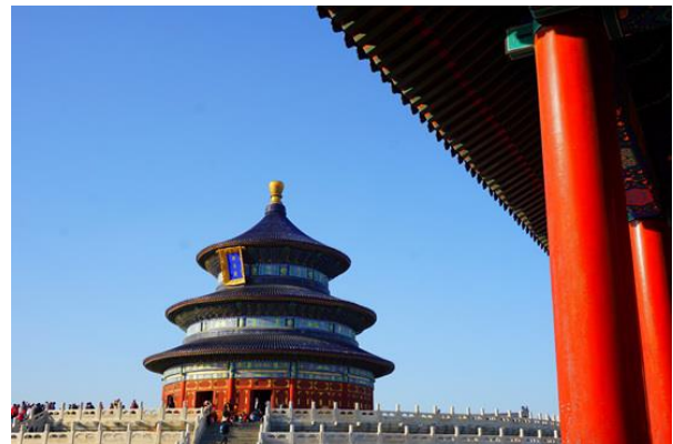
Temple of Heaven

The Temple of Heaven is an imperial complex of religious buildings. Emperors of the Ming and Qing dynasties always held annual ceremonies to pray for good harvests. Currently it is a park in Beijing. If you go there in the morning, you will see people aging from 10 to 80 do morning sports, or participate in different kinds of group activities.