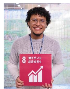
2019 and 2020 SDGS