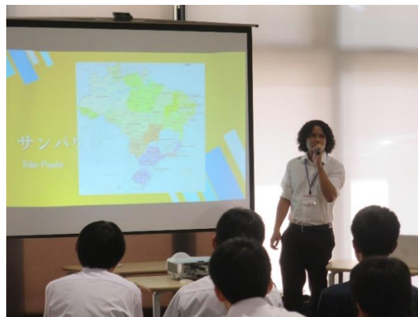
2019 Open Campus

In the concierge, I could also make tours in the library, explain how to use the mysterious stacks with electrical powered mobile moving system, and I always enjoyed these moments. A library is a living place, and its quietude can be understood as boredom, but once you are involved in this universe, you realize that the truth is completely the opposite.