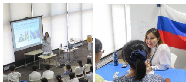
Open Campus Ceremony (2019)

It was also fun to participate in the Welcome week, the Global session and the Open campus events. I got an opportunity to make presentations about my home place quite a few times and now many Japanese students know about the existence of the Republic of Sakha (Yakutia).