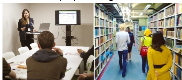
Library Guidance and Tour (2019, 2017)