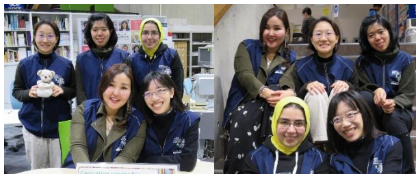
International Student Concierge Members (2019)

While working in the library, I got an opportunity to introduce the job to my friends and labmates so they could also join the team, bringing their unique input and fresh energy. I think that this is the essence of this job – you help the others in need, share your experience, learn something new by yourself and make a lot of new friends!