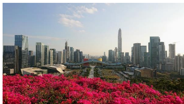
View from the top of Lianhuashan (the Lotus Hill).

Finally, you cannot miss Dim Sum (点心) while visiting Shenzhen. It is a traditional Cantonese food featuring various small dishes that will never disappoint you.