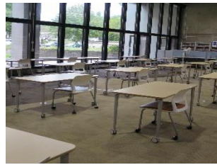
Flexible Working Area

When entering the library, please remember to clean your hands and measure your temperature!