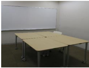
Group Study Room