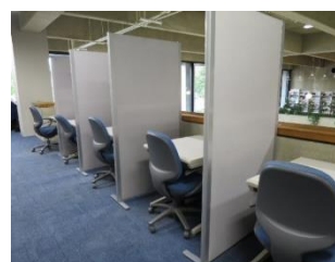
Second Floor Reading Corner

There is also another area where you can take online classes and attend meetings. It is located at the corner of the reading room on the 2 nd floor. You can have a wonderful view of the library.