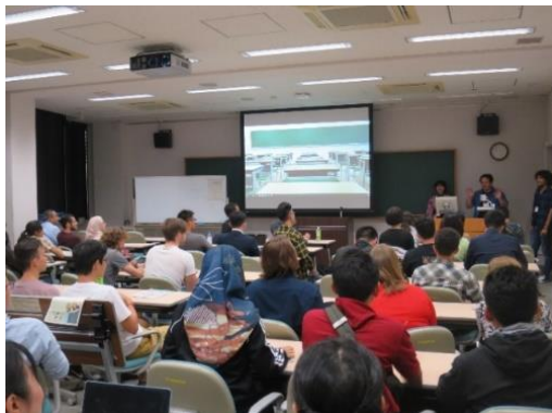
Question and answer session.

This year new semester, for October intake students, our main library is actively participating in the welcoming and orientation activities of the university and this Vivi Sendai program is one of those appealing support.