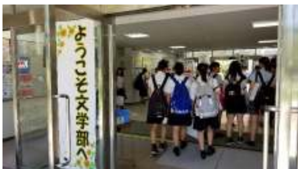
Figure 1: High school students entering Faculty of Arts and Literature building in Kawauchi Campus

Tohoku University Kawauchi North and South Campus saw a different atmosphere from usual on July 25 th and 26 th . Buses painted in vivid colors arrived at Hagi-Hall and International Center Station Parking Area. High school students from Tochigi Prefecture, Fukushima Prefecture, Akita Prefecture, and other prefectures donning their summer uniforms got off the bus one by one and, their usual cheerful and exciting voices sounded louder and louder.