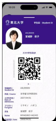
Digital Student ID

The fall semester of 2025 brought a new development for students at Tohoku University. We now have an official App—the Tohoku University Official App, that will make your student life easier and more convenient. By downloading it on your phone and inputting your Tohoku ID and password, you will have access to a QR code that will work as your digital student ID. You can use this ID to enter the Main Library, to borrow books, and even to enter the Stack Room if you are a graduate student! That means that even if you forget your physical student ID, as long as you have your phone with you, you will have no trouble accessing the Library Services, so don't forget to check out this new feature!