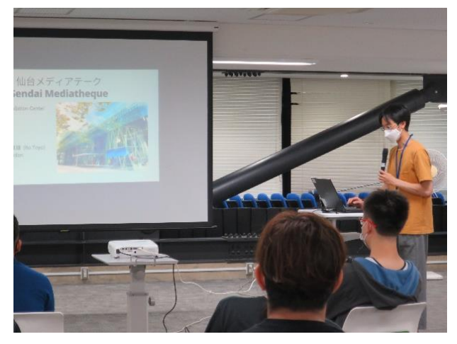
Global Session 2022

However, they were still making the greatest efforts to make the library services accessible to everyone. For example, guidance lectures about how to effectively use the library were given online when actual guidance tours in the library were not possible. Electronic newsletters consisting of tips for life in Sendai and ISC members' miscellaneous sharing were published every one or two months. I was glad to be able to help deliver the guidance lectures/tours, write essays sharing my favorite books and my hometown, and provide necessary translations throughout all the tasks.