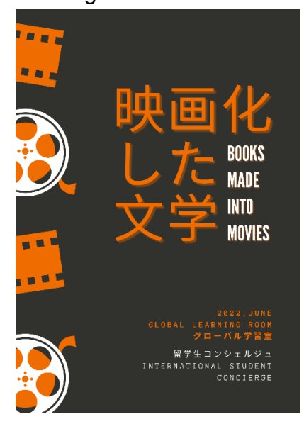
Book Exhibition Poster

was also excited to share with everyone some movies and literatures that I found to be interesting.