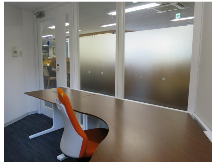
Private Research Room