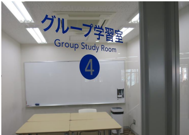
Group Study Room

You can make reservations for the “ Group Study Room ” and “ Private Research Room (only for graduate students and teachers)” in the main building.